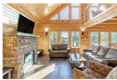
CRAGUN'S RESORT (888) 452-2178 www.craguns.com

hotel rooms, reunion Situated on a mile-long with two beaches, giant s centre, award-winning om pontoon boats to named "Property of the Year" keepers and a "Top Ten at Living.