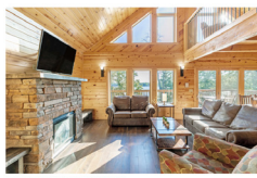
CRAGUN'S RESORT (888) 452-2178 www.craguns.com

hotel rooms, reunion Situated on a mile-long with two beaches, giant s centre, award-winning om pontoon boats to named "Property of the Year" keepers and a "Top Ten at Living.