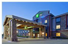
Host Your Next Meeting with Us!

This is a GOOD ad. This ad costs $35 and includes a logo or graphic image, headline, and 25 words of text and a hyperlink.