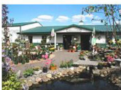
Landsburg Landscape Nursery!

This is a GOOD ad. This ad costs $35 and includes a logo or graphic image, headline, and 25 words of text and a hyperlink.